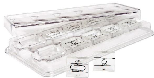
Full D-668 in PET-G cleanroom packaging

The D-668 comparison sample set is provided in a 10 slot PET-G box suitable for use in cleanrooms up to ISO Class 4.