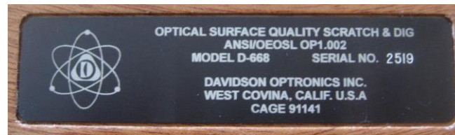
Davidson Optronics D-668